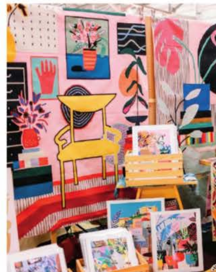
Fort Mason features (clockwise from top) events such as the Renegade Craft Fair ; Radhaus beer hall and restaurant; Equator Coffees ; art at the West Coast Craft show; and views of the bay.

As we stand at the fort, admiring the bay views, I also think of the city that unfolds behind me to the south. San Francisco, with its numerous charms, encompasses ever-popular areas such as Fisherman's Wharf, a short walk away, and quieter locales, such as the ocean beaches at the edge of the city. In the Bay Area, urban retreats such as