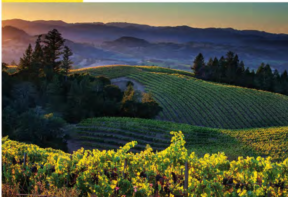
TOP TO BOTTOM: TARTINE: KELLY PULEIO; IN SHIVE / TANDEMSTOCK.COM