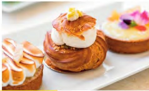
Clockwise from left: Some of San Francisco's top attractions include the Golden Gate Bridge, Ghirardelli Square and cable cars, as well as great places to eat such as Le Marais Bakery.