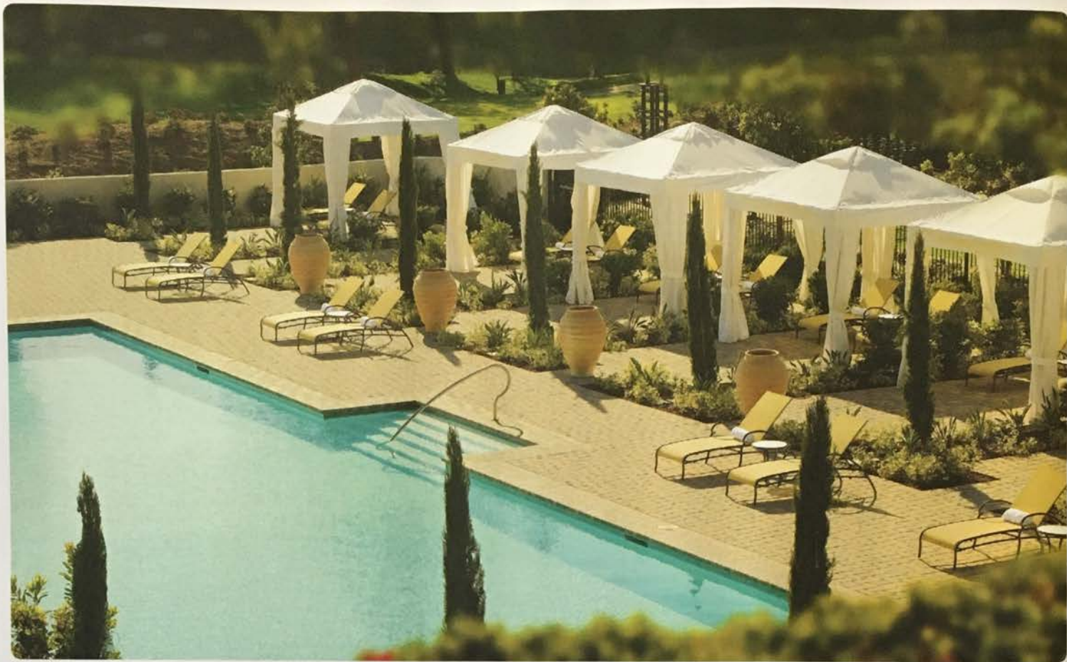
Poolside at the Rancho Bernardo Inn.

Diego International Airport and far removed from big city bustle, is at the center of San Diego North. This 2,000-square-mile region stretches 35 miles along the coast from La Jolla to Oceanside. It also reaches inland, past Escondido and the surrounding foothills, toward Anza-Borrego Desert State Park.