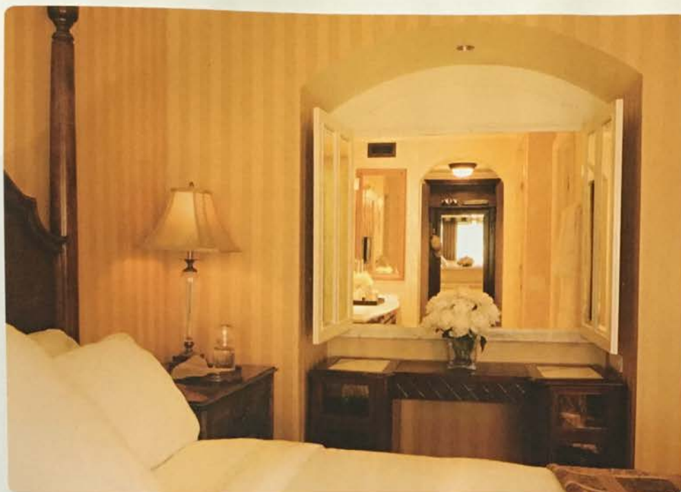
Above, Guest room at the Grand Del Mar; below, pool at The Lodge at Torrey Pines.