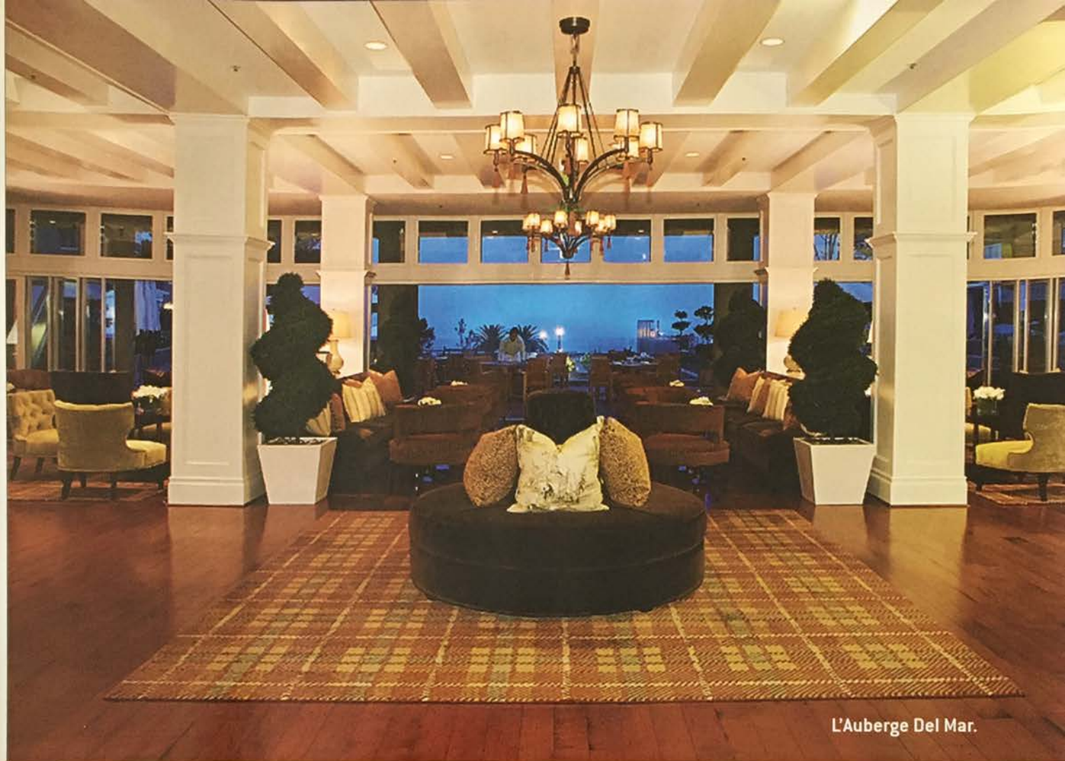
L'Auberge Del Mar.