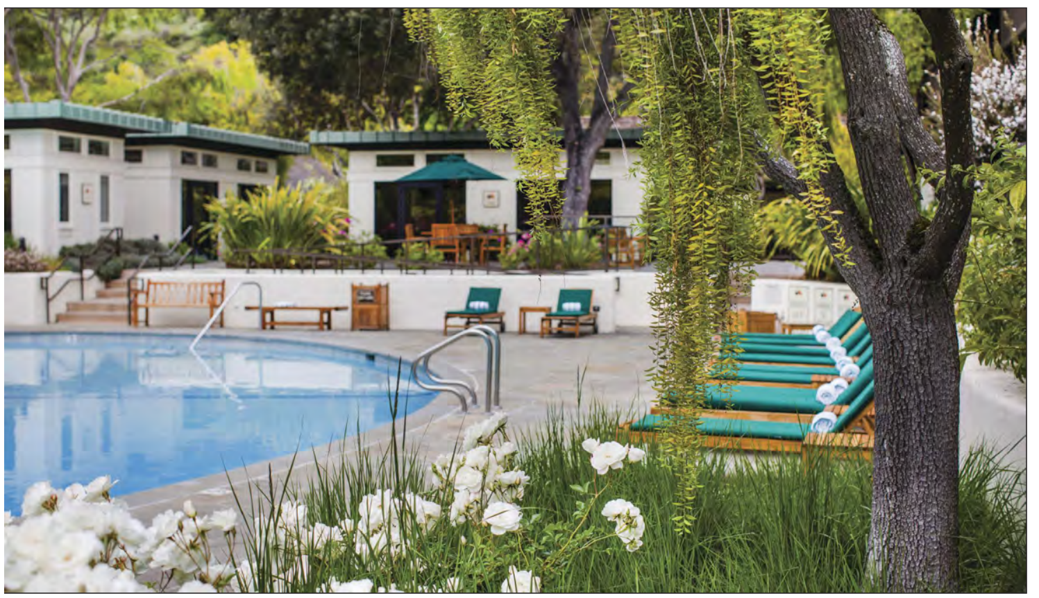
(Top) The Land Rover Experience Driving Center at Quail Lodge & Golf Club takes participants out for off-road driving adventures and lessons. (Bottom) The tranquil resort pool on the 850-acre property in picturesque Carmel Valley.

Quail Lodge guests and local visitors order breakfast dishes at Waypoint, and the lounge also presents happy hour specials, trivia competitions, hospitality-industry nights and other