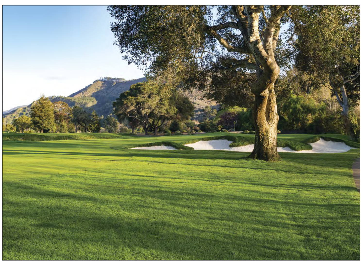
(Top) The two-bedroom villa suite at Quail Lodge is 2,000 square feet, and offers private en suite bathrooms, gas fireplaces, a powder room and a living room. (Bottom) The 18th hole at Quail Golf Club.