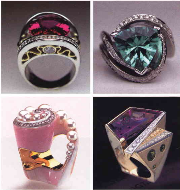
Stunning suspension settings and the Spectrum Award-winning “Neptune’s Birth” have earned national acclaim for Weber Goldsmith Gallery.

her home country’s gem industry. Celebrities have selected her vibrant sapphire and tourmaline designs for red carpet walks. Still, she wants her jewels worn in all settings.