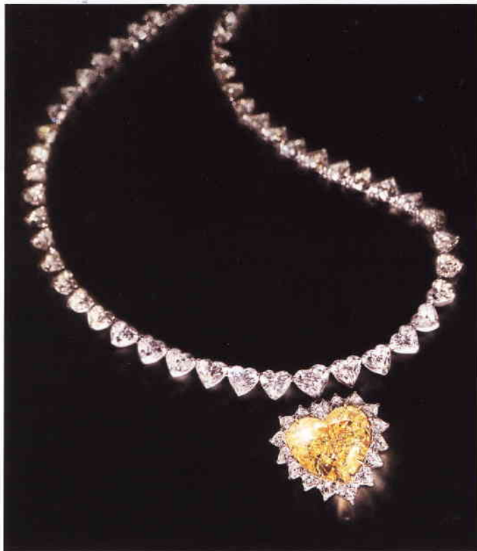
Dazzling large diamonds draw clients to Marchesa Jewelry.