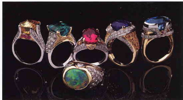
Cayen Collection’s bright gems are saturated with eye-popping color.