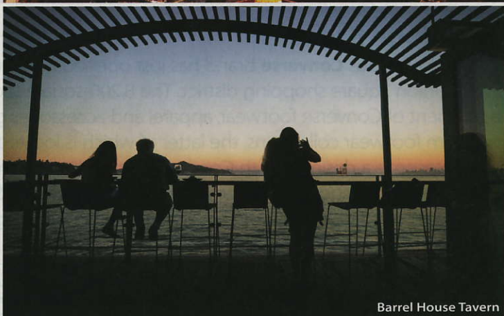
Barrel House Tavern